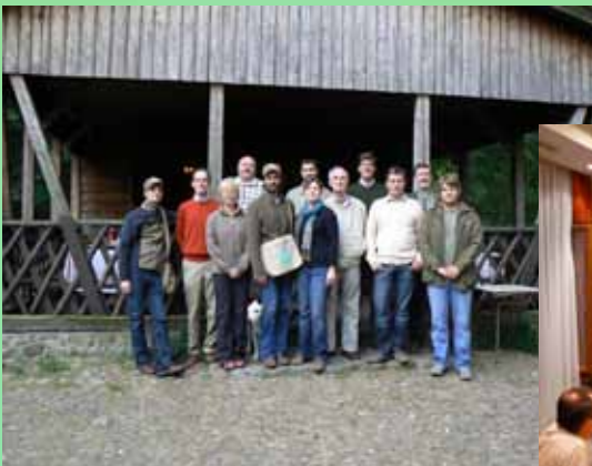
Natura 2000 workshops in Poland and Hungary