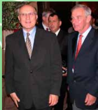
Launch of Artemis project in presence of Commissioner DIMAS. Athens, 2006.