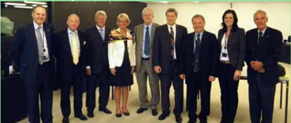
Launch of the new "Hunting" Intergroup for 2009-2014 term.

Since 1985, FACE has run the Secretariat of the Sustainable Hunting Intergroup in the European Parliament. This Intergroup offers a platform for rural stakeholders, not just hunters, to share their concerns and ideas primarily to EU policy makers. This Intergroup does however also recognise multi-level governance and brings together national and international policy makers. In the past the Intergroup has discussed and taken position on wide ranging issues from specific ones like Large Carnivores and Cormorants to more general topics (e.g. rural development) and international issues (e.g. CITES).